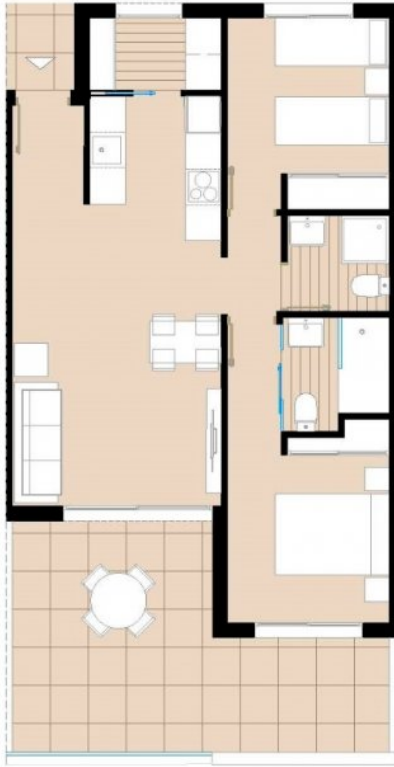
First Floor/ Planta Primera (E:1/100)