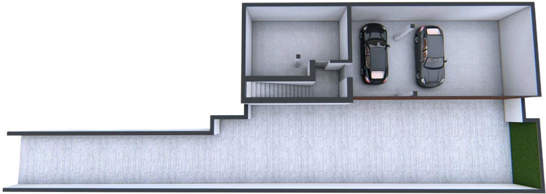
PLANTA DE SÓTANO