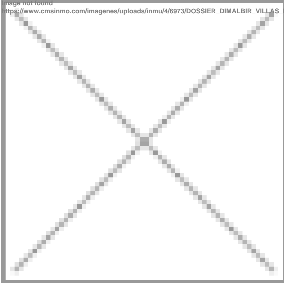
Image not found https://www.cmsinmo.com/imagenes/uploads/inmu/4/6973/DOSSIER_DIMALBIR_VILLAS_ESPAÑOL