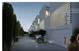
Image not found https://www.cmsinmo.com/imagenes/uploads/inmu/4/6973/DOSSIER_DIMALBIR_VILLAS_ESPAÑOL