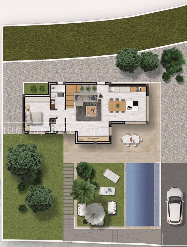
PARCELA 02 PLANTA BAJA (1/100)