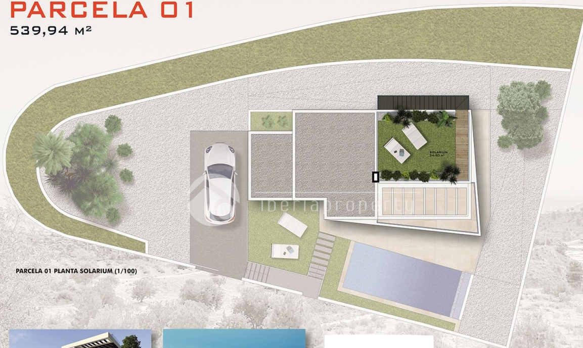
PARCELA 01 PLANTA SOLARIUM (1/100)