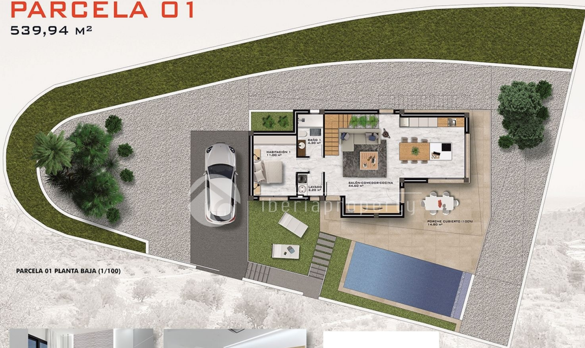
PARCELA 01 PLANTA BAJA (1/100)