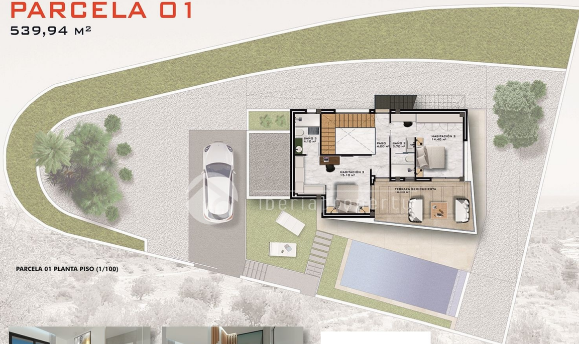
PARCELA 01 PLANTA PISO (1/100)