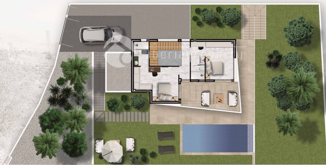
PARCELA 05 PLANTA BAJA (1/100)