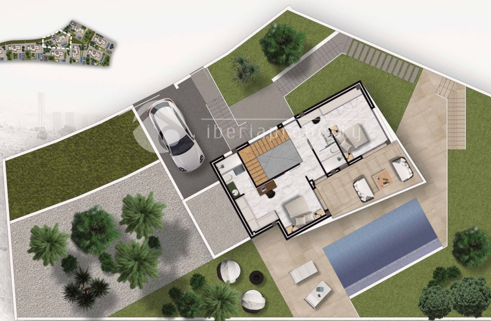
PARCELA 04 PLANTA BAJA (1/100)