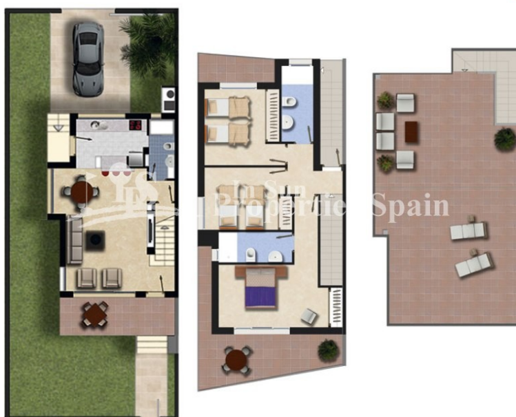
Imagen Artística carece de valor contractual/Artistic Image free of contractual nature