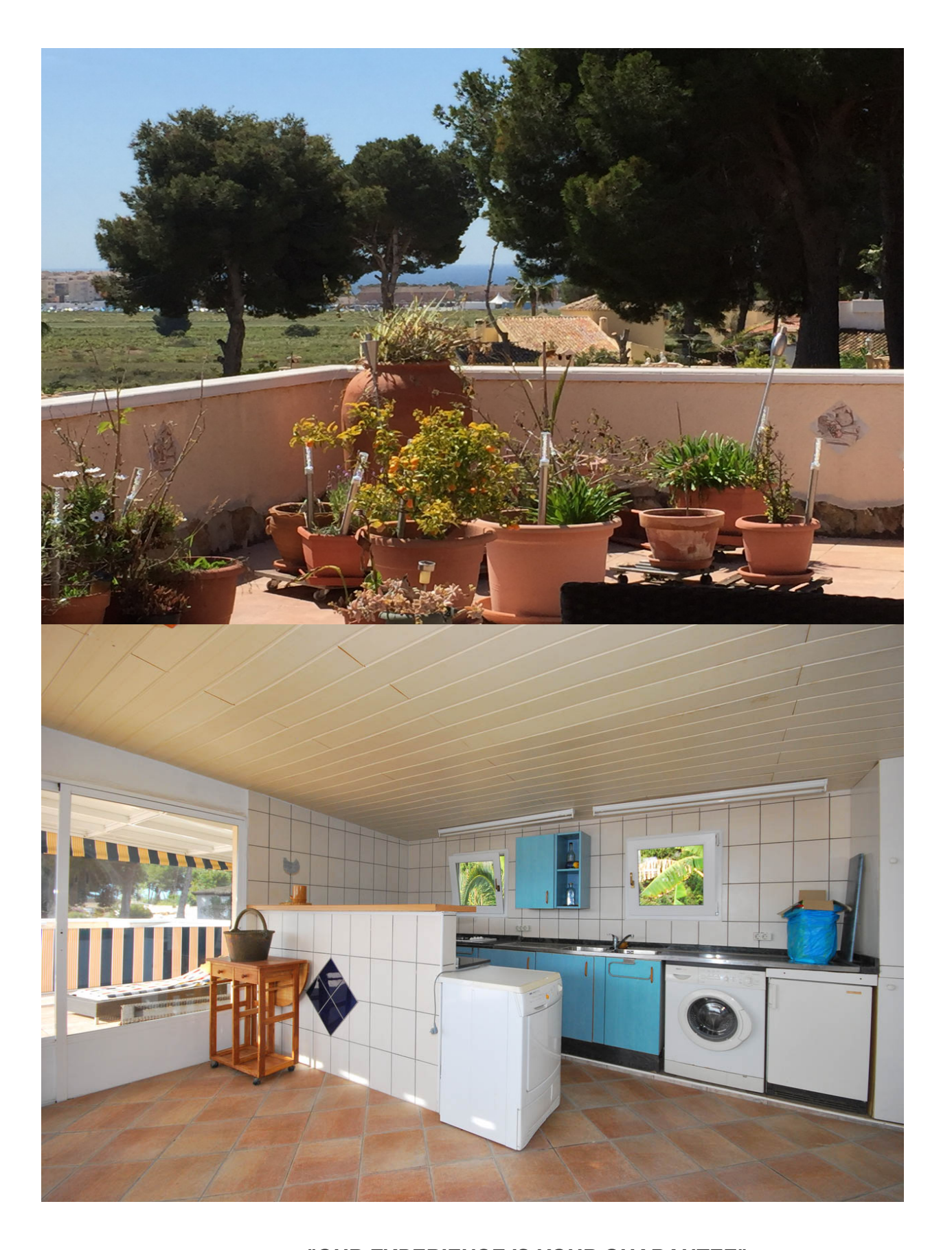
"OUR EXPERIENCE IS YOUR GUARANTEE"