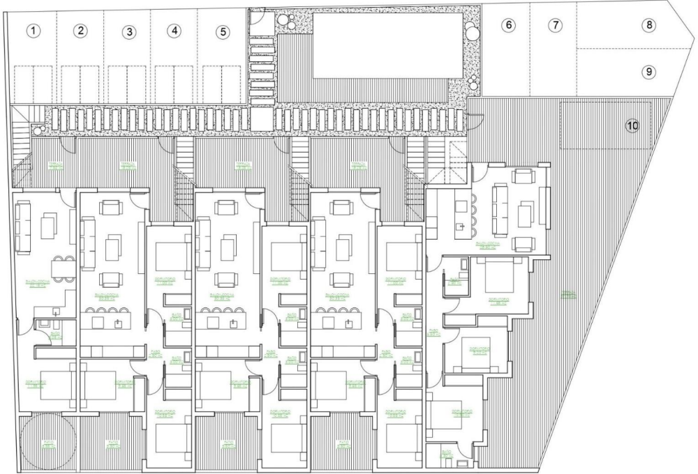
Planta Baja Conjunto