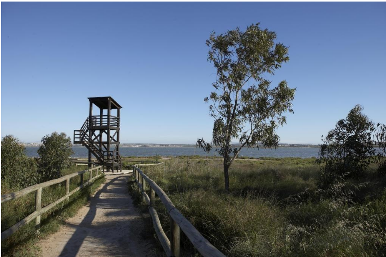
Imagen informativa sin escala / Informative image not scaled and subject to changes. Se reserva el derecho de modificaciones por motivos técnicos, jurídicos o comerciales.