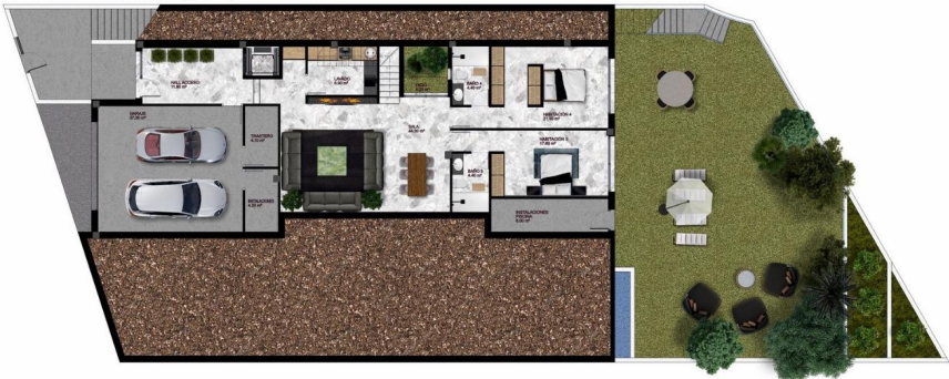
PLANTA SEMISOTANO (1/150)