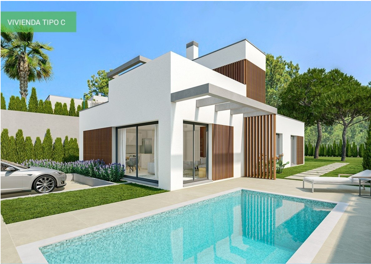
VIVIENDA TIPO C