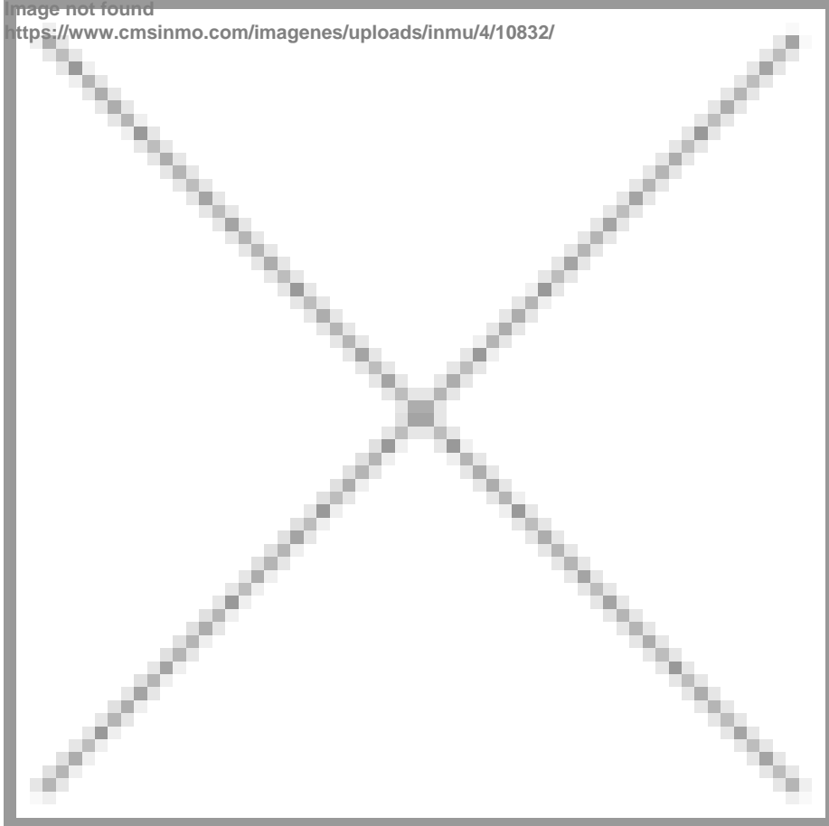
Image not found https://www.cmsinmo.com/imagenes/uploads/inmu/4/10832/