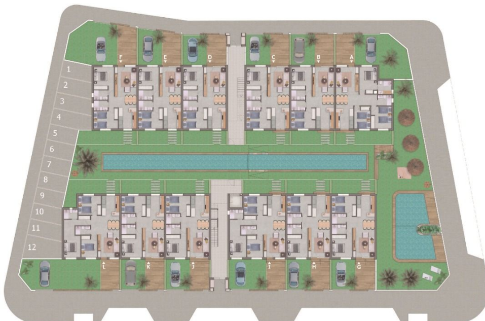
Planta Baja / Ground Floor

SUPERFICIE CONSTRUIDA VIVIENDA.....70.04 m 2