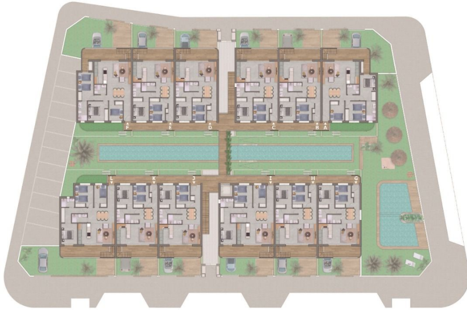
Planta Primera / First Floor