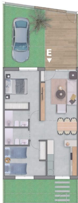
Planta baja / Ground Floor