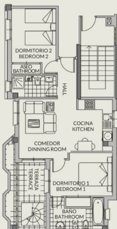
PLANTA BAJA LOW LEVEL

ÁTICO DÚPLEX / DUPLEX PENTHOUSE 3 DORMITORIOS / 3 BEDROOMS PLANTA 6ª / 6th FLOOR ESCALERA 4 / STAIR 4