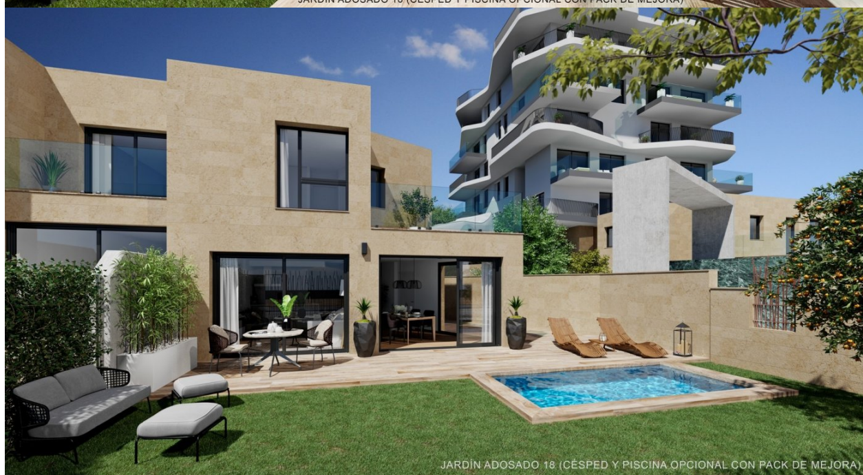
JARDÍN ADOSADO 18 (CÉSPED Y PISCINA OPCIONAL CON PACK DE MEJORA)