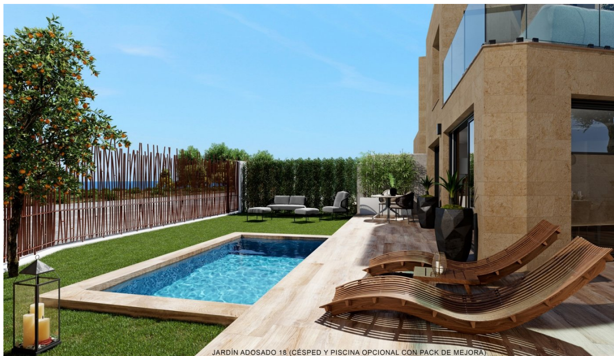
JARDÍN ADOSADO 18 (CÉSPED Y PISCINA OPCIONAL CON PACK DE MEJORA)