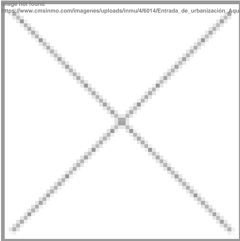
Image not found https://www.cmsinmo.com/imagenes/uploads/inmu/4/6014/Entrada_de_urbanización_Aqua_(alta_r