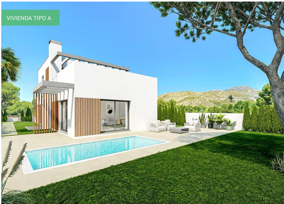
VIVIENDA TIPO A