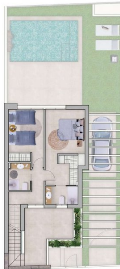
Planta Primera / First Floor