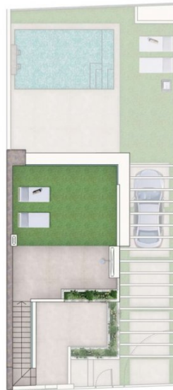
Planta Cubierta / Rooftop Solarium