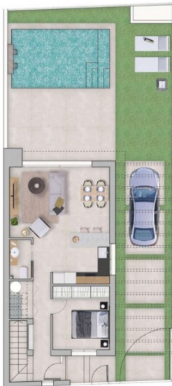
Planta baja / Ground Floor