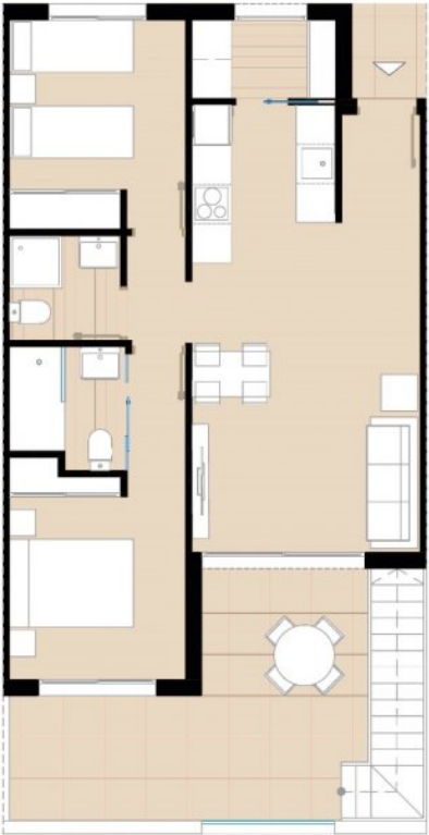
Second Floor/ Planta Segunda (E:1/100)