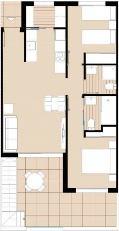
First Floor / Planta Primera (E:1/100)