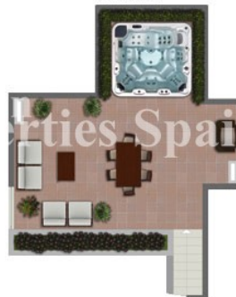
Imagen Artística carece de valor contractual/Artistic Image free of contractual nature