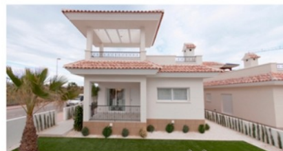
Imagen Artística carece de valor contractual/Artistic Image free of contractual nature