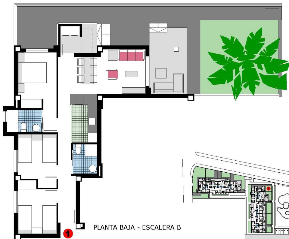
PLANTA BAJA - ESCALERA B