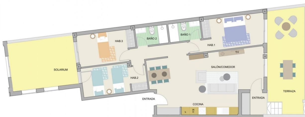
VIVIENDA BAJO A OPCIÓN 1